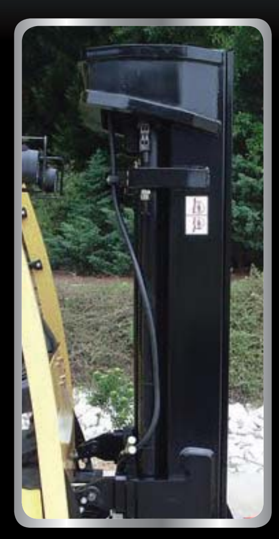
COMPACT RAIL STACK REDUCES LOST LOAD CENTER AND MAXIMIZES CAPACITY